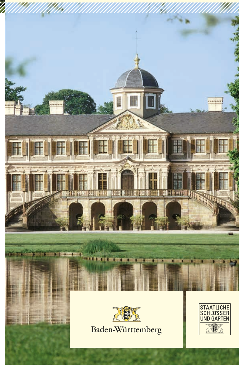
Design concept: www.jungkommunikation.de